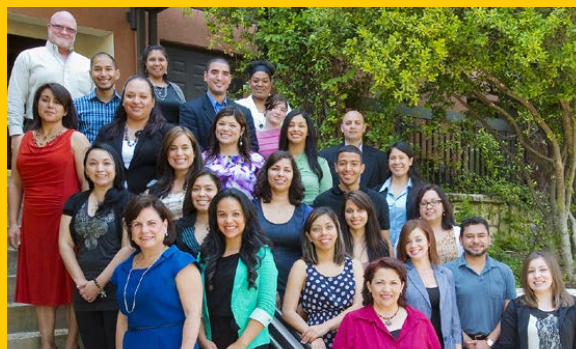
Éxito! Alumni 2012