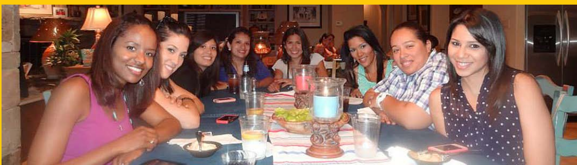
Éxito! 2013 BBQ