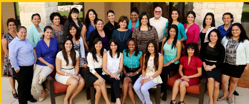
Éxito! Alumni 2013

See what alumni are saying about their experience during the Éxito! Summer Institute.