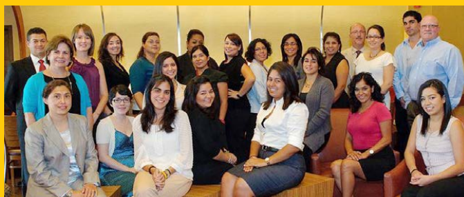
Éxito! Alumni 2011