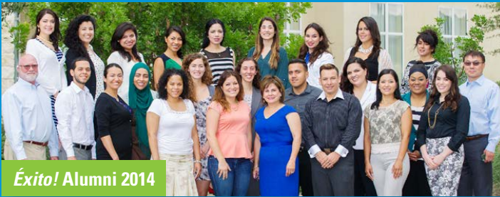
Éxito! Alumni 2014