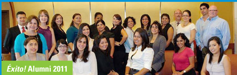
Éxito! Alumni 2011