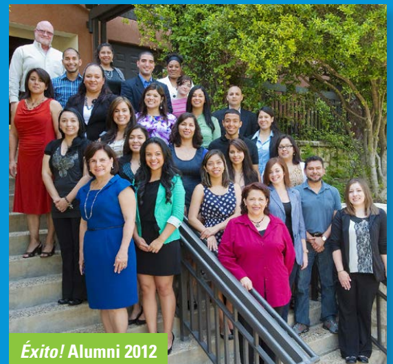
Éxito! Alumni 2012