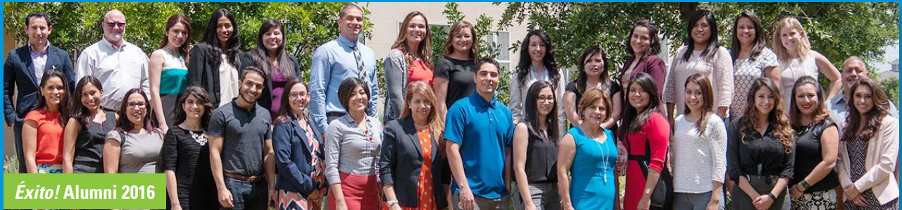
Éxito! Alumni 2016

See what alumni are saying about their experience during the Éxito! Summer Institute.