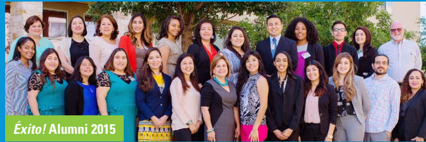
Éxito! Alumni 2015