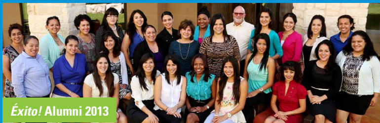
Éxito! Alumni 2013