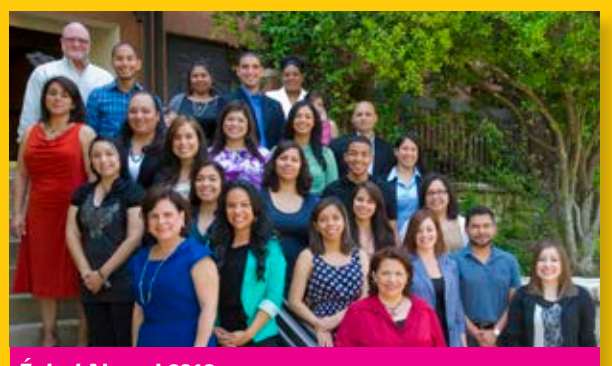
Éxito! Alumni 2012

See what 2012 alumni are saying about their experience during the Éxito! Summer Institute.