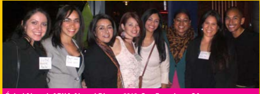
Éxito! Alumni, APHA Alumni Dinner, 2012, San Francisco, CA